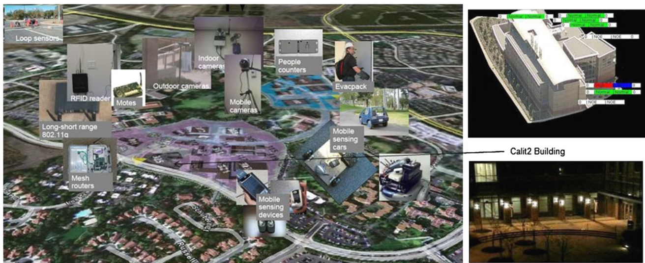
Fig. 1 Responsphere—an instrumented cyber-physical space at UC Irvine

humans who, through situational awareness systems, observe dynamically changing environments and respond to critical events. Indeed, the larger deployments exemplify a societal scale CPS system with a broad range of users and devices.