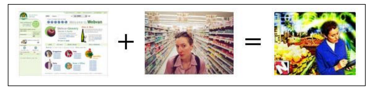
Figure 1: The goal of LAWS is to add location-aware virtual browsing to the users' experience in the physical space (i.e.: supermarket)