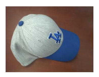
Figure 6: Sample training image