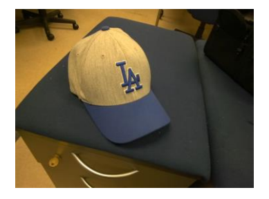
Figure 7 : Sample validation image

taken by Google Glass. The ultimate aim of such a system would be to help people with memory problems to recognize their personal belongings.