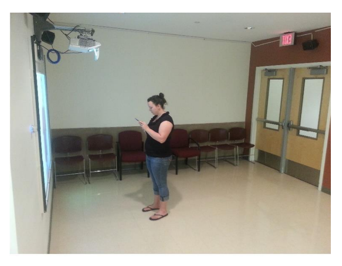
Figure 1: Experiment Setup: Subject's Perspective and Side View