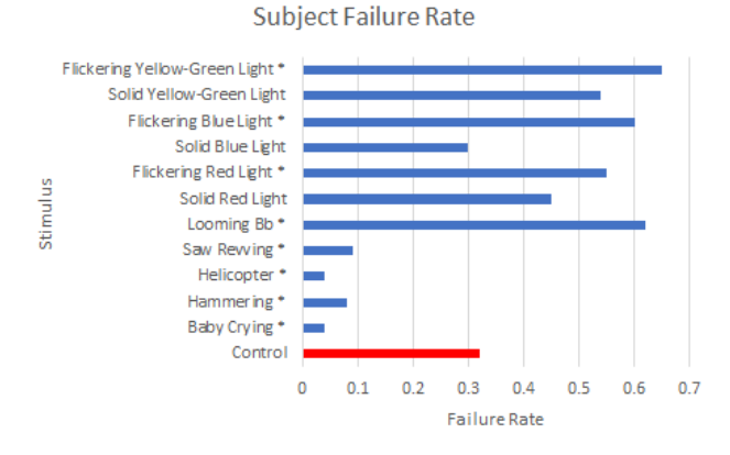
Figure 2: Failure Rates by Stimulus, and Comparison with Control (* = p <0.05 uncorrected)

Figure 2 shows the failure rate for the control condition and each stimulus condition. Applying Barnard's Exact Test pairwise between each stimulus condition and the control condition shows that many differences between failure rates are statistically significant (p < 0.05) with respect to all five sound stimuli. However, these stimuli do not impact subject success rates uniformly. We discuss implications of this divergent result in the following section.