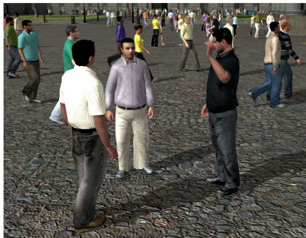
Figure 1: Screenshot of our real-time crowd system with dynamic agents and conversing groups.

Many developments have been made in real-time crowds over the past years, with video games such as Assassin’s Creed involving the investing of significant resources into developing interactive and believable crowds [Bernard et al. 2008]. However, still missing from real-time crowd applications is the concept of realistic conversing