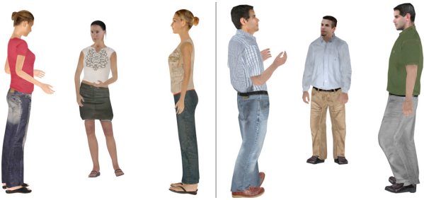
Figure 3: Examples of stimuli used in our experiments: (L) a real female debate and (R) a real male dominant speaker conversation.

For each dominant speaker conversation, we chose two different temporal offsets from the start of the conversation to begin a 10 second conversation clip. For each debate conversation, we chose six different offsets. For the dominant speaker conversations, we annotated clips to tag each character as either a speaker or listener. For the virtual representations of the real conversations, we played the correct conversational audio and motion capture clips simultaneously. The synthetic conversations were made up of the conditions displayed in Tables 2 and 5 and described in Section 3.