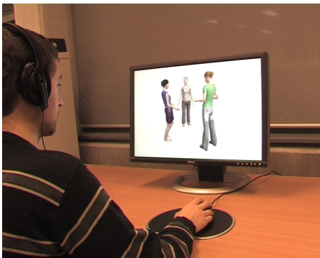
Figure 4: Participant in Localized Audio experiment.

The experiments were run on a workstation with 4GB of RAM, a Creative SB Audigy 2ZS soundcard and an 8-series G-Force graphics card. The stimuli were displayed on a 24-inch widescreen monitor and participants used Sennheiser HD 202 headphones to listen to the audio (Figure 4). Participants viewed each trial for 10 seconds and were asked to indicate using a mouse click whether they thought that the conversation they viewed was real or synthetic . We found through interviewing participants that 10 seconds was an adequate time for them to make their decisions. We randomly associated the right or left mouse button with the real response so as to avoid any bias towards a particular button-press. Similarly, 50% of our stimuli were real, in order to avoid any bias. After a participant gave his/her response, a cross was displayed to focus attention on the centre of the screen.