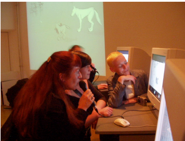
Figure 2: Several participants interact with AlphaWolf at Ars Electronica 2002.

In addition, a subset of reproductive behaviors such as courtship and mating are closely related to the other social behaviors. However, due to factors relating to social