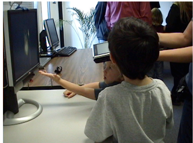
Figure 5: A child reaches out his hand, expecting one of the characters to jump onto it.

"Island Metaphor" of this project offers a rationale for the relationship of real space and virtual space. For more information on the Virtual Raft Project, please watch the following short online video (Tomlinson, 2004).