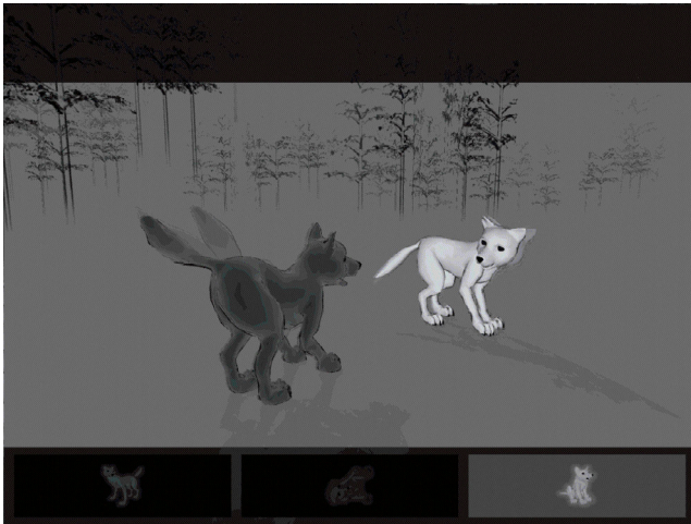
Figure 1: Two virtual wolf pups play in the AlphaWolf installation.

segment from the television show Scientific American Frontiers with Alan Alda (PBS, 2002).