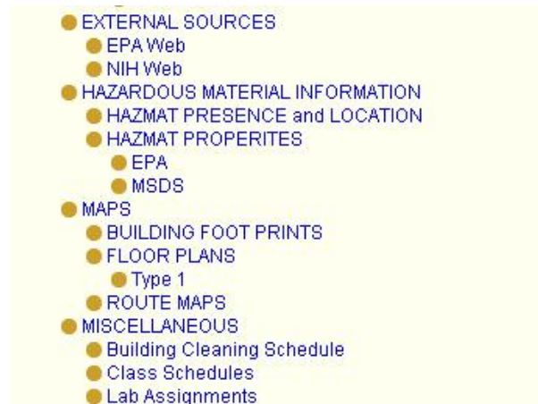
Fig 3 Information Categories Ontology

We assembled an EBox instantiation in the context of a larger drill and demonstration exercise. The "incident" triggering the evacuation was a mock hazardous material spill in a hallway of a campus building. During this drill the EBox system was deployed at a simulated incident command post. From this position the incident commander had access to a variety of resources from the EBox. These included detailed floor plans of the two affected buildings, Word documents containing hazmat inventory for nearby labs in one of the buildings, and ability to view video streams from surveillance cameras installed in the two affected buildings. The EBox data was integrated into a separate fire IT system providing an integrated view of the situation to the incident commander including other sensor information and firefighter localization. The drill involved EHS personnel from UCI, observers from the OCFA and OFD fire departments, and the technical team members. We provide details of some of the EBox related information sources that we assembled.