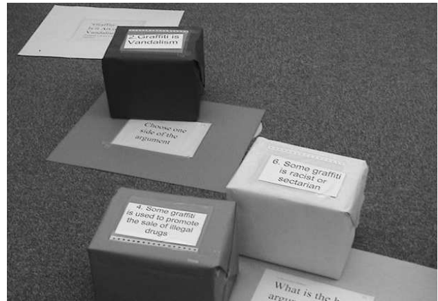
Figure 2. An early low-tech prototype. These kinds of prototypes are generally not recognizable to teachers or children as “technology”.

involving a lot of play, brainstorming, exploring of multiple options and testing of many low-fidelity prototypes. They tend rather to see design as a linear process, in which a single idea is pursued and refined by the designers, and only tested with users at the point where there is little design work left to be done, apart from ironing out a few minor glitches.