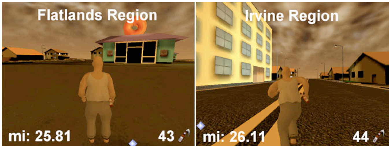
Figure 3 Torque Game Client 3D Region Samples

Later Greta arrives back home and logs into Guy's Blog from her PC. She now sees her updated game-state information as well as a visual mapping of her movement in space and time. She also has a Blog-based link to a Web-page associated with the key object that contains a key-code that will allow her to gain access to critical game related information. Once accessed, her initial quest is completed, her stats are updated, and a new Blog post and quest are made available. Next time she thinks she may even want to try the 3D client (see screenshots in Figure 3). But for now, she's had enough of Guy and his chaotic world (see http://unexceptional.arts.uci.edu/ ).