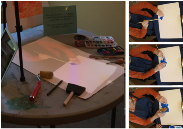
Figure 1. Left: Images of Diane making art are played in sequence and projected onto the art studio table. Right: Example images captured during therapy session.

does not seem to recognize or connect with her artwork after it is made. The therapist wanted to design an exhibit that would showcase Diane's process of creation.