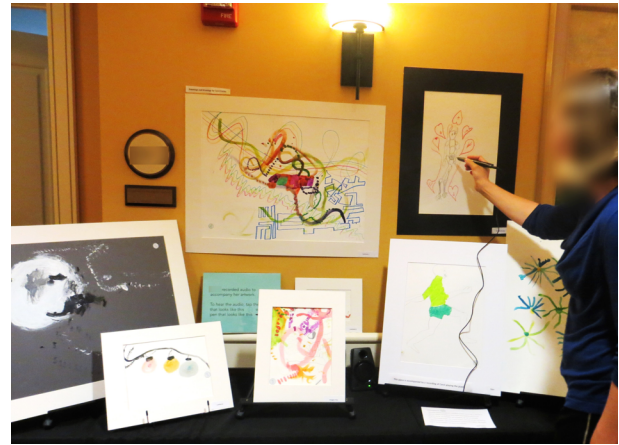
Figure 3. Therapist and resident used Livescribe Smartpen Sound Stickers to attach audio recordings to artwork. Tapping the pen on artwork plays an audio caption or accompanying music.

Clara herself said, “ to see it hanging up there with music that I’d chosen to go with it was very powerful... It seemed