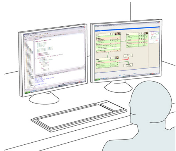
Figure 5. Side-by-Side View of Code and Emerging Design.

Jazz [2] is another workspace awareness tool that is integrated into Eclipse. It specifically provides information of which arti-