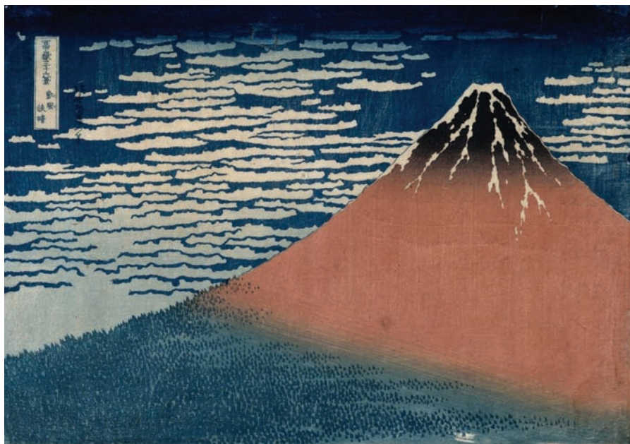
Figure 2. Katsushika Hokusai, “South Wind, Clear Sky (Gaif kaisei) or “Red Fuji,” a color woodblock print, Japan, AD 1830–33.