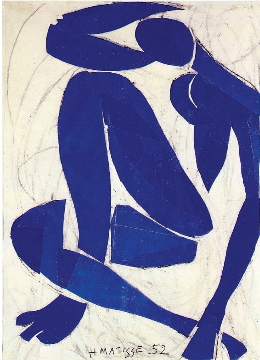
Figure 1. Henri Matisse, "Naked Blue IV," 1952; paper cutouts.

The rest of this article explores this hypothesis and makes recommendations for future work. We first discuss what abstraction is and its role in computing and other disciplines. Others, such as Hazzan [5] and Devlin [2] have also discussed abstraction as a core skill in mathematics and computing. Using findings from cognitive development, we explore the factors affecting students' ability to cope with and perform abstraction. We discuss whether or not abstraction is teachable and suggest that steps must be taken to test abstraction skills as a means of validating our hypothesis, checking our teaching techniques and even, perhaps, selecting our students.