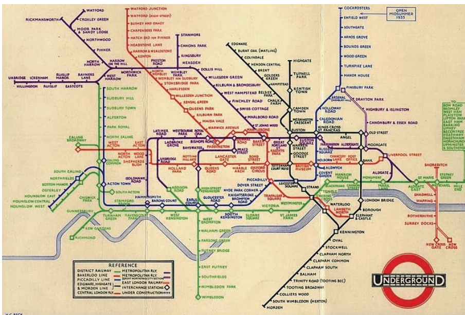
Figure 3. The London Underground Map (a) the 1928 map and (b) the 1933 map by Harry Beck.

In fact, abstraction is fundamental to mathematics and engineering in general, playing a critical part in the production of models for analysis and in the production of sound engineering solutions.