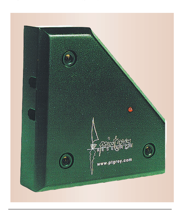
Figure 3. Digiclops color 3D camera, made by Point Grey Research and used by the Microsoft Research Easy Living group to provide stereo-vision positioning in a home environment.

vision systems typically use substantial amounts of processing power to analyze frames captured with comparatively low-complexity hardware.