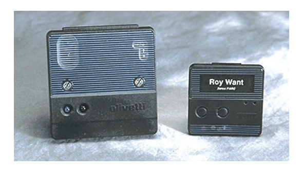
Figure 1. Olivetti Active Badge (right) and a base station (left) used in the system's infrastructure.

A general technique for providing recognition capability assigns names or globally unique IDs (GUID) to objects the system locates. Once a tag, badge, or label on the object reveals its GUID, the infrastructure can access an external database to look up the name, type, or other semantic information about the object. It can also combine the GUID with other contextual information so it can interpret the same object differently under varying circumstances. For example, a person can retrieve the descriptions of objects in a museum in a specified language. The infrastructure can also reverse the GUID model to emit IDs such as URLs that mobile objects can recognize and use.<sup>2</sup>