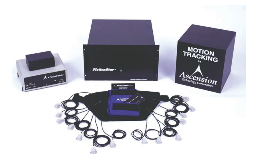
Figure 2. MotionStar DC magnetic tracker, a precision system used in motion capture for computer animation, tracks the position and orientation of up to 108 sensor points on an object or scene. Key components include (left and right) the magnetic pulse transmitting antennas and (center) the receiving antennas and controller.

Several groups have explored using computer vision technology to figure out where things are. Microsoft Research's Easy Living provides one example of this approach. Easy Living uses the Digiclops real-time 3D cameras shown in Figure 3 to provide stereo-vision positioning capability in a home environment.<sup>11</sup> Although Easy Living uses high-performance cameras,