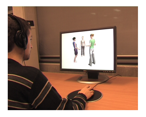
Figure 4: Participant in Localized Audio experiment.

The experiments were run on a workstation with 4GB of RAM, a Creative SB Audigy 2ZS soundcard and an 8-series G-Force graphics card. The stimuli were displayed on a 24-inch widescreen monitor and participants used Sennheiser HD 202 headphones to listen to the audio (Figure 4). Participants viewed each trial for 10 seconds and were asked to indicate using a mouse click whether they thought that the conversation they viewed was real or synthetic . We found through interviewing participants that 10 seconds was an adequate time for them to make their decisions. We randomly associated the right or left mouse button with the real response so as to avoid any bias towards a particular button-press. Similarly, 50% of our stimuli were real, in order to avoid any bias. After a participant gave his/her response, a cross was displayed to focus attention on the centre of the screen.