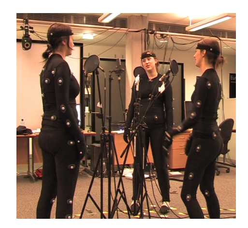
Figure 2: Our audio and motion capture setup with three female actors.

Two sets of actors participated in recording sessions where we recorded both their voices and body movements. The first set contained three males aged between 25 and 31. The second had three females aged between 22 and 28 (see Figure 2). We chose two groups of actors in order to test if our results were generalizable. Briton and Hall [1995] found that female actors were more expressive with gestures and that female participants rated female gestures higher than male gestures, which were found to be less fluid and more interruptive. We chose groups of three to allow us to capture group dynamics that would not be as present if using groups of two, such as turn taking, interruptions and gaze shifting. All actors were non-professionals and were accustomed to the motion capture setup and environment. We also ensured that actors knew each other and were informed about the topics that they would be discussing in advance, in order to ensure natural, realistic conversations.