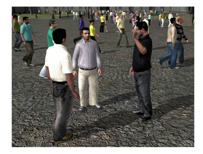
Figure 1: Screenshot of our real-time crowd system with dynamic agents and conversing groups.

Many developments have been made in real-time crowds over the past years, with video games such as Assassin's Creed involving the investing of significant resources into developing interactive and believable crowds [Bernard et al. 2008]. However, still missing from real-time crowd applications is the concept of realistic conversing