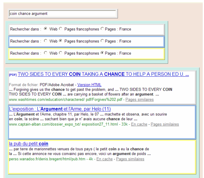
Figure 2: A trivial example of ingredient-based computing, showing the pursuit of multiple parallel navigations on the World Wide Web. On the left the user has set up a combination of cells in a tool called C3W (Clip, Connect and Clone for the Web) that is being developed in collaboration with Jun Fujima at Hokkaido University [paper submitted for review]. These cells contain active elements extracted from the search site google.fr, and hande, respectively, the search input field; the switch that selects whether the search should cover the whole Web, just pages in French, or just pages in France; and the top result (showing page name and keyword context) from a completed Google search. On the right the user has replicated the switch cell to create three alternatives, and has set each to a different option; because the search-result cell depends directly on the switch (through a pseudo-formula whose ‘calculation’ involves submitting a query to Google), it has been automatically replicated too. Entering new search keywords into the tool in this state will launch three queries, and display the three respective top results.