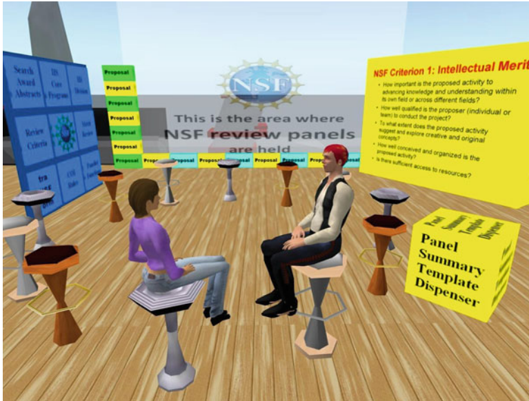
Fig. 2.1 One of the areas where virtual review panels are held by NSF